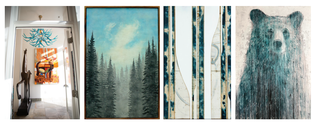
FOLLOW THE JOURNEY @gallerymar